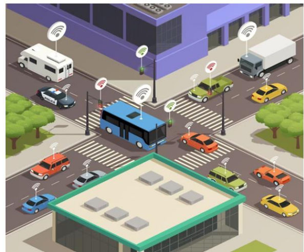
Fig: Connected Cars

Connected Cars project, the intricate web of technology and innovation unfolds, promising a paradigm shift in how we perceive and address emergency situations on the road.