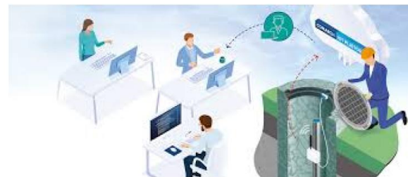
Fig: Manhole Monitoring

manhole covers are vital components of utility networks, ensuring the proper functioning of sewage and utility lines. However, these covers are susceptible to a range of challenges, including theft, displacement, and degradation, all of which can lead to severe safety risks and disruptions in essential services. With an unwavering commitment to addressing these issues, this project leverages advanced technology to introduce a comprehensive and real-time monitoring system for manhole covers. The primary objectives of the initiative are multi-faceted, encompassing the enhancement of public safety, prevention of unauthorized access, improvement of infrastructure maintenance practices, real-time data analysis, and cost efficiency in infrastructure management.