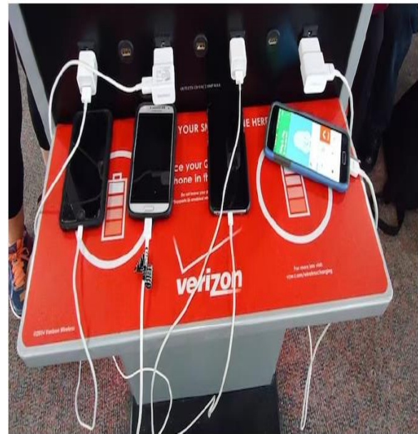
Fig : Charging Station

"PowerUp Pass" emerges as a revolutionary solution, bridging the gap between the ubiquitous need for on-the-go charging of electronic gadgets and the advanced technology employed in electric vehicle charging stations. Unlike conventional charging solutions, this innovative platform offers users the convenience of booking slots for charging their electronic devices through a user-friendly mobile application. The seamless user experience allows individuals to not only reserve a charging slot but also make payments based on both the duration of the charging time and the electricity consumed during the process