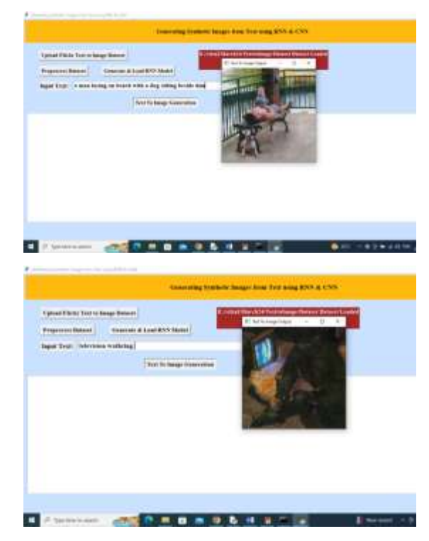
In above screen got image for 'televsion watching'.

In above screen for given text will get below image